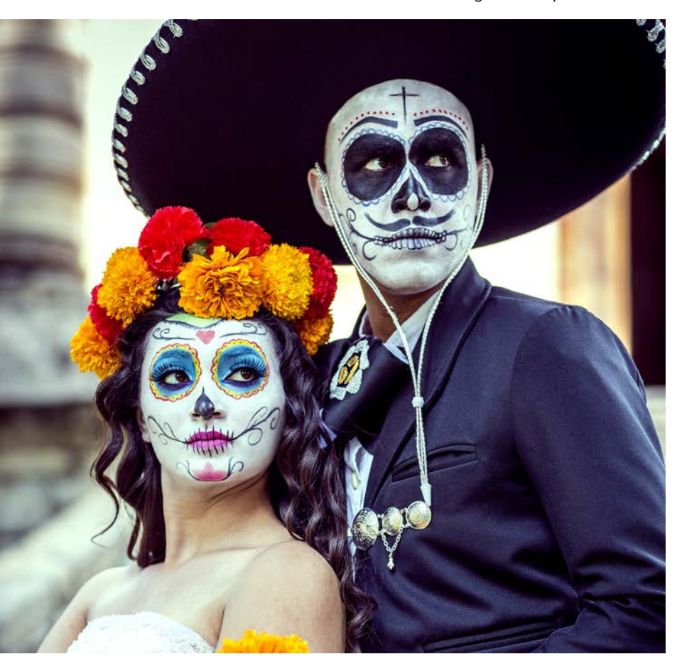
* Information deemed accurate but not guaranteed. All information subject to change.

Get your spook on with several FREE haunted houses and scare zones located throughout the park.