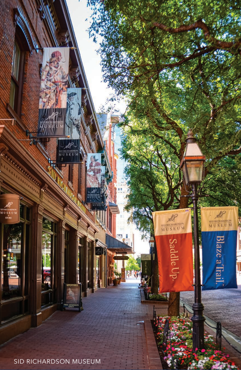
SID RICHARDSON MUSEUM